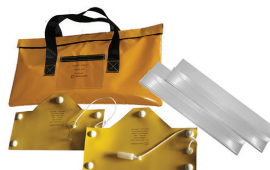
Street light column kit