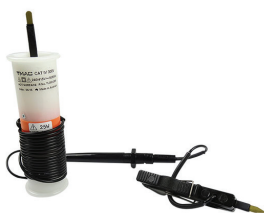
415V test lamp