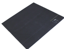
Insulated ground mat