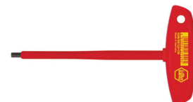
Insulated hex key