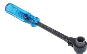
IPC ratchet spanner