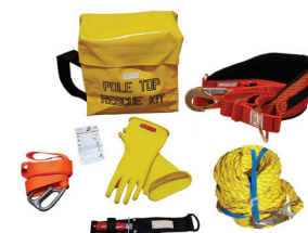
Pole top rescue kit