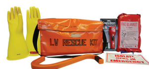
Switchboard rescue kit