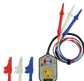
Phase rotation meter