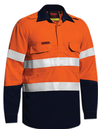
Arc rated shirt